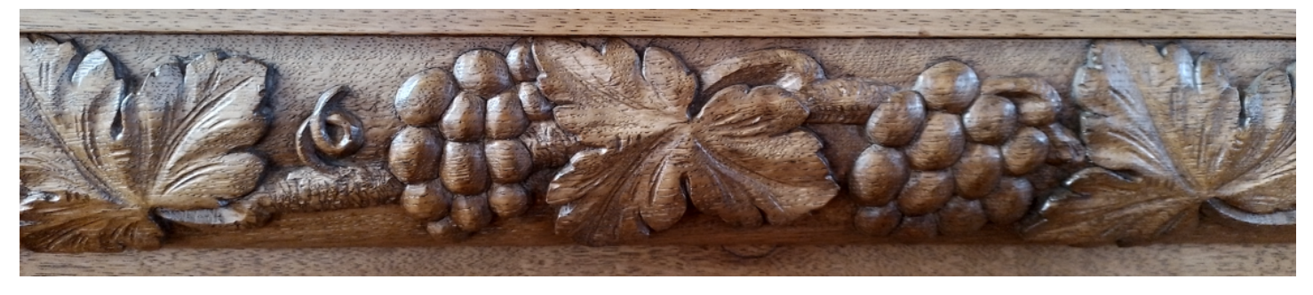
This is a photo of some of the carving on the Knox communion table, "I am the vine, you are the branches"